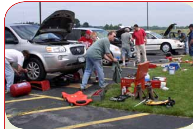
Above & below: Scenes from past years' Car Care Connections.

CONESUS NURSING HOME — Visit with residents. All ages welcome! Meet at the facility, 6131 Big Tree Rd., Livonia, 1:45–3:00 PM.