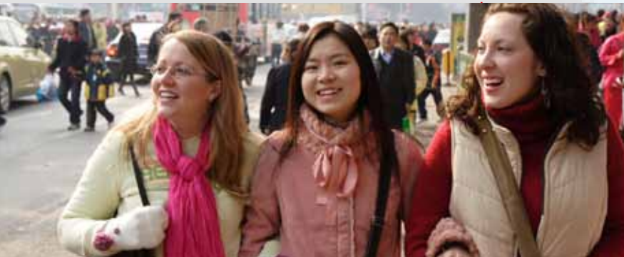
Campus Target is busy this summer! New team members are preparing to leave in August, hoping to reach Asian college students this year.