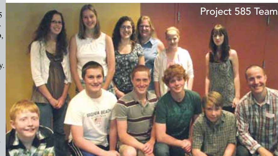
Project 585 Team