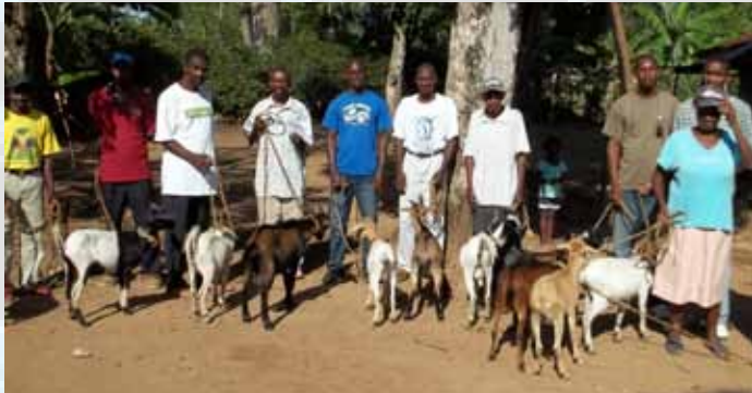
Ten families in a Haitian church received a goat, in a special program that will benefit the village and their church. Read below for more.